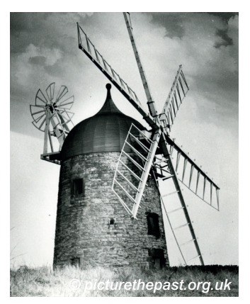
The restored Heage Windmill

sailed windmill: work on it started in 1791 and it was first recorded as working in 1797. Originally built with four sails, improvements in 1894 led to six sails. The mill sails were virtually destroyed by the weather in 1919 and the mill was not used again until the restoration was completed in 2002. Each of the six sails weighs nearly one ton, and the tower is built from local sandstone. The windmill is a Grade II listed building and is now a major Derbyshire attraction.