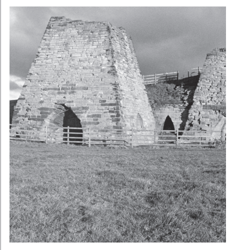
The remains of the Morley Park blast furnaces

The first Morley Park furnace was built for Francis Hurt of Ambergate in 1780 and the second added in 1818. Iron ore and limestone were tipped from the top into charging holes and the blast was introduced by a battery of steam engines. The furnaces were supplied by a series of banks of coke ovens and 3000 yards of wagonways. Production stopped in 1874 but the furnaces were restored in 1986, so they can still be visited today.