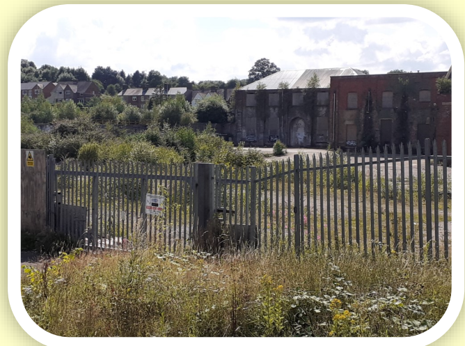
Former Butterley Ironworks site in Ripley

Of course, the Butterley site was at the very heart of the Industrial Revolution, being a trail-blazer and pioneer of engineering manufacturing processes. BIT proposes to tell the story of Butterley's impact on