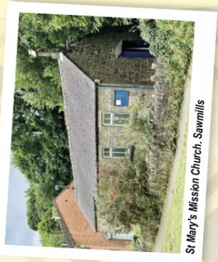
St Mary's Mission Church, Sawmills

It was intended that this should be a chapel of ease to Heage, however Ambergate parish and Sawmills became a separate ecclesiastical parish, and the mission church of Sawmills St Mary was started in 1903.