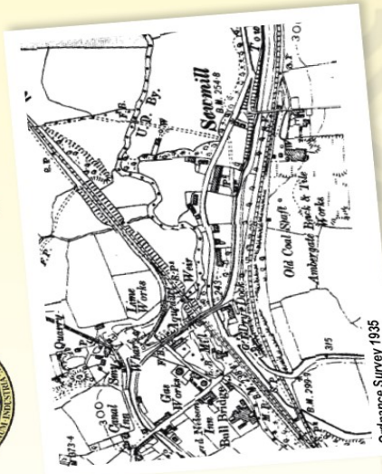
Ordnance Survey 1835

The village is named after the sawmills used for cutting marble that were near the canal and river. The marble cut at the site originated from Hopton Wood Quarry, probably brought to the sawmill by horse drawn wagon. The stone was used for facing fine houses around Britain after travelling down the canals to the River Trent.