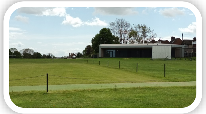
Greenwich Park, home of Butterley United Cricket Club and Ripley Town Football Club

Unfortunately, Amber Valley Borough Council made a late decision not to carry on funding the grass-cutting for a 3-year period; this was despite having promised to do so and the late decision meant replacement services had to be found quickly. However, following discussions with the Greenwich Park Sports Partnership about the specification of works, and after a tendering exercise, a replacement contractor has been appointed and they are doing a good job.