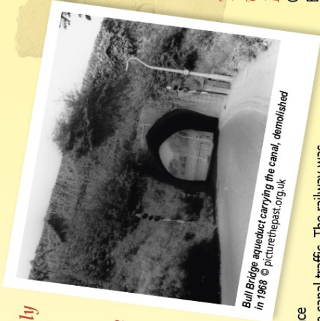
Bull Bridge aqueduct carrying the canal, demolished in 1968

The village grew mainly because it was next to Cromford Canal and the Cromford to Langley Mill Turnpike Road. There was an aqueduct built for the canal to cross the river and road, but when the railway was built the problem of crossing the canal was solved by the building of an iron trough, 150 feet long that was floated into place overnight so as to not impede canal traffic. The railway was driven through the bank beneath the trough and the stone bridge built over the railway line. The aqueduct carrying the canal over the road was demolished in 1968 to widen the A610.