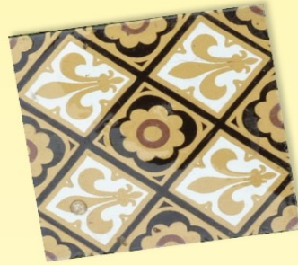
Ambergate Brick and Tile Company tile, probably made around 1880

There was also a brickyard at what is now known as Riversdale. This was owned by Edwin Glossop, probably starting in 1917. Butterley Brick Co. bought the works in 1947, and it finally closed in 1970, becoming a tip. Bricks from this works were used to build the houses in Riversdale and also used in the building of the new Roman Catholic Cathedral in Liverpool.