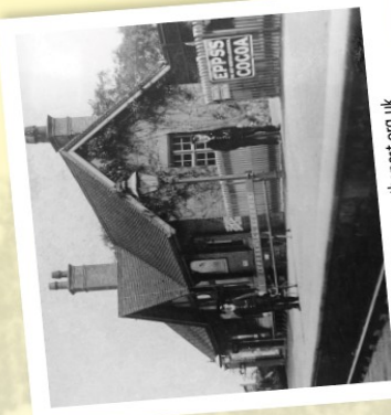
Crosshill Station

The colliery was served by a branch line from the Ripley to Heanor railway, with a station for passengers at the bottom of the village at Crosshill. This opened in 1890 and closed in 1926. The effects of the new tramway to Nottingham and the cheap fares, the disruption of the First World War and finally the General Strike were too much for this line.