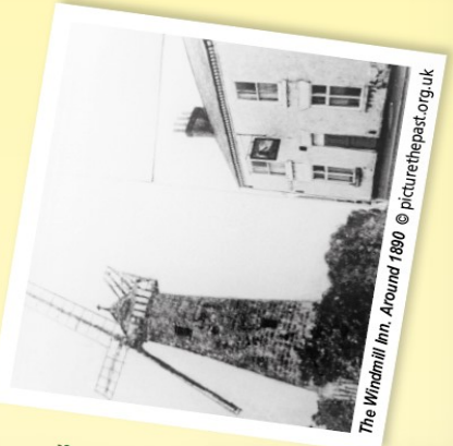
The Windmill Inn. Around 1890

There were few buildings on Waingroves Road above Jessop Street until after 1900, but there were four pubs in the village until the mid 20th century: The Windmill at the top of the village, Jolly Colliers and Thorn Tree around the middle of the village and the Britannia at the bottom.