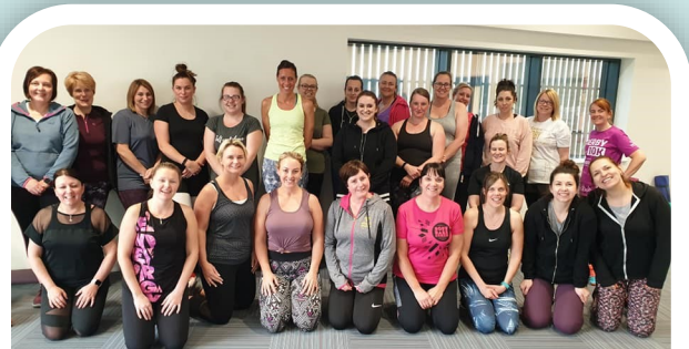
The first Ripley Girls Can session at the Greenwich community facility, Ripley in May 2019.

The new Greenwich Park, located on Nottingham Road, Ripley has now opened. They are working with RGC and Ripley Leisure Centre to provide as many opportunities for Girls and Women to get involved in physical activity and to reduce the barriers to participation. An energetic and fit community is the goal for Ripley and we want Greenwich Park to be one of the places to go to for RGC .