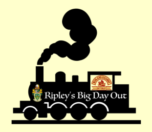
Wed 10<sup>th</sup> July 2019 10am - 4pm