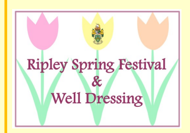
Sunday 19<sup>th</sup> May 2019 10am - 4pm