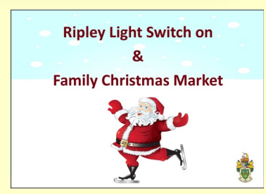
Fri 29<sup>th</sup> Nov at 6.30pm & Sun 1<sup>st</sup> Dec 2019, 10am - 4pm