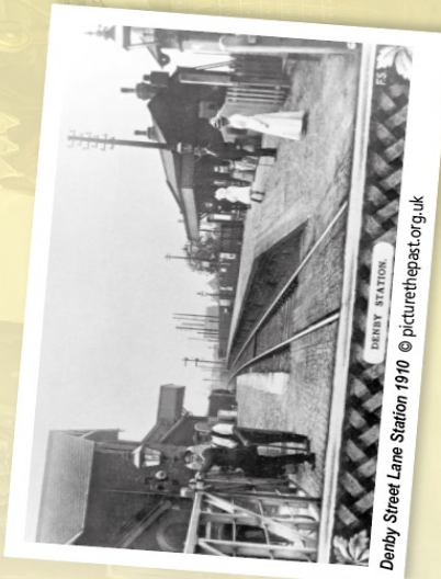
Denby Street Lane Station 1910

The railway provided a siding for the Denby Iron and Coal Company and there was also a facility for processing the slag from the iron production. In 1901, the Nottingham surveyor Edgar Purnell Hooley was visiting the site and noticed some tar that had been spilled and covered with iron foundry slag. A major trouble with highways at that time was the dust raised by increasingly speedy vehicles and various ways had been tried unsuccessfully for binding the road surface. He noticed that this surface had withstood the passage of traffic and obtained a British patent for producing what he called Tarmac. In 1903 he formed the TarMacadam (Purnell Hooley's Patents) Syndicate Limited.