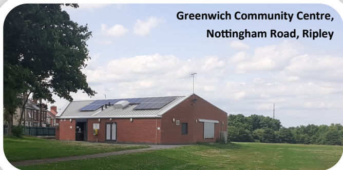
Greenwich Community Centre, Nottingham Road, Ripley

The building on the recreation ground will now be known as Greenwich Community Centre, emphasising that the building has many uses for everyone and is not just a changing facility for sports clubs that use it. There is a kitchen and bar facility that is available for hire by any group or individual. It is typically used for business meetings, community groups, training events, and parties.