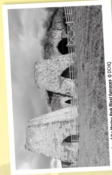
The remains of the Morley Park Blast Furnaces

At the northern end of Street Lane we can still see the remains of the Morley Park furnaces. These were cold-blast and coke-fired iron smelting furnaces. These are Grade II listed and are also a Scheduled Ancient Monument.