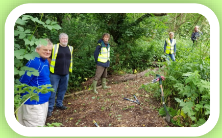
A group of Friends of Ripley Greenway volunteers

Volunteers worked on pulling up an invasive plant Himalayan Balsam, further along the brookside towards the Bear sculpture. If left to grow, this plant takes over, crowding out all other natural plants.