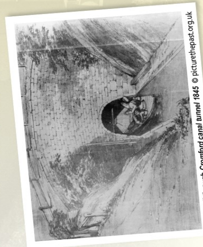
"Legging" through Cromford canal tunnel 1845

The canal included a tunnel 2996 yards long and the Butterley Reservoir was created to provide a ready supply of water. The canal opened in 1793.