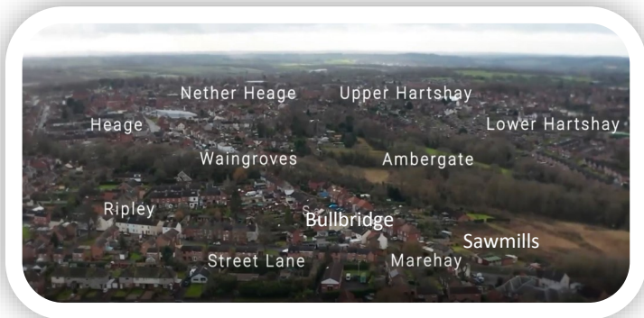
The Ripley Township

Looking to the future, later this year Ripley Town Council will be starting to detail the processes and timetable for establishing a new Neighbourhood Plan, to take effect in 2028. How we go about it, and how you can get involved, will be reported in future newsletters.