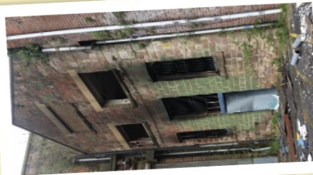
Disguise painting of works building

There were many developments on the Butterley Works site and products included tram rails, steam engines and bridges. The St Pancras Station roof, the Falkirk Wheel (the world's first rotating boat lift) and Portsmouth's Spinnaker were all manufactured here.