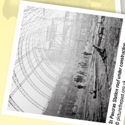
St Pancras Station roof under construction

Butterley Company employed thousands of people from Ripley and the surrounding area, with farms, collieries, Riddings Ironworks and brickyards all belonging to the Company. The works had its own railway network, fire brigade, post office and health centre.